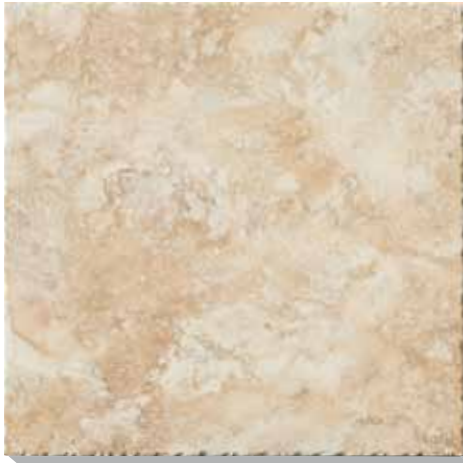
3Y08 Aureliano TO 20"x20" 3Y04 Aureliano TO 13"x13"