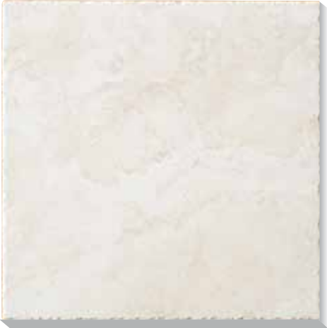
3Y07 Cesare BI 20"x20" 3Y03 Cesare BI 13"x13"