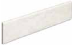
AG55 Cesare BI Bullnose AG56 Augusto BG Bullnose AG57 Tiberio NO Bullnose AG54 Aureliano TO Bullnose 3 1 / 8 "x13"