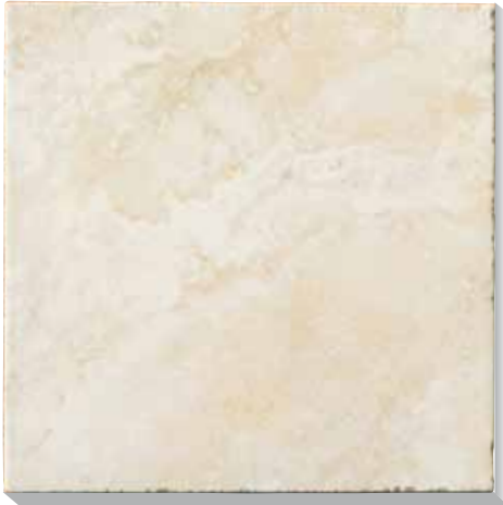
3Y06 Augusto BG 20"x20" 3Y02 Augusto BG 13"x13"