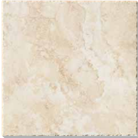
3Y05 Tiberio NO 20"x20" 3Y01 Tiberio NO 13"x13"