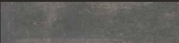
BC06 Oxido 6" x 24"