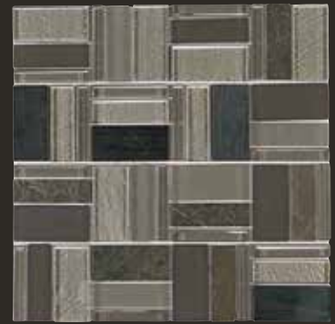
GL07 Espresso 3" Glass & Stone Block 12" x 12" Sheet