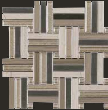
GL06 Pewter Glass & Stone Pinwheel 12-3/4" x 12-3/4" Sheet