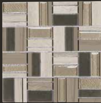
GL06 Pewter 3" Glass & Stone Block 12" x 12" Sheet