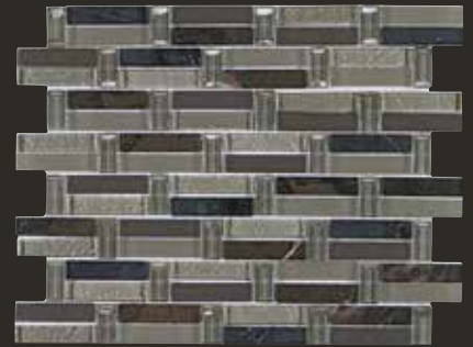
GL07 Espresso Glass & Stone Basket Weave 10-5/8" x 14" Sheet