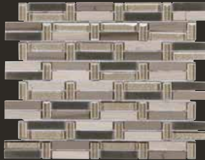
GL06 Pewter Glass & Stone Basket Weave 10-5/8" x 14" Sheet