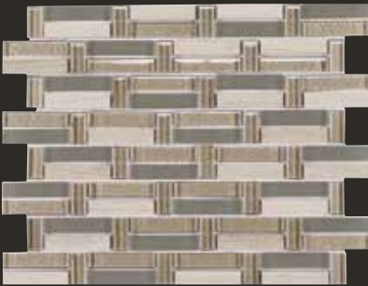
GL05 Argento Glass & Stone Basket Weave 10-5/8" x 14" Sheet