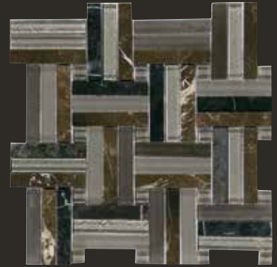
GL07 Espresso Glass & Stone Pinwheel 12-3/4" x 12-3/4" Sheet