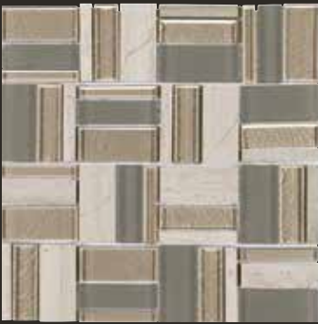
GL05 Argento 3" Glass & Stone Block 12" x 12" Sheet